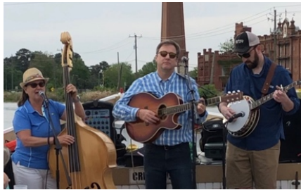
Rae's Creek Revival